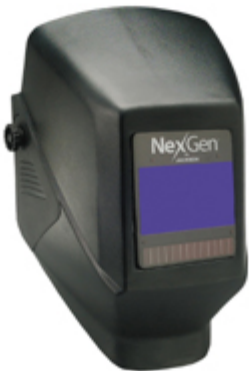
Auto Darkening Welding Helmet

Cybershield teamed with the OEM to design and fabricate the selectively plated plastic lens cover, where the EMI shielding was applied precisely to areas on the interior of the Lens Housing. PC/ABS was specified due to its low cost, high impact strength and ability to be plated. Cybershield applies selective electroless plating with 10-20 micro-inches (0.25-.50 \mu ) Nickel over 80-120 micro-inches (2.0-3.0 \mu ) Copper. The customer required lot certification that the coating met the ASTM 3359 plating adhesion standard.