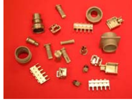
Plated Plastic Shielded Connectors