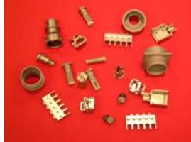
Plated Plastic Shielded Connectors