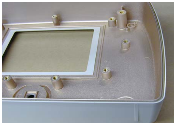
Conductive Gasket on Machined Metal Housing

For more information about this application, Cybershield capabilities and/or to review your application requirements for metallized plastic, contact Cybershield