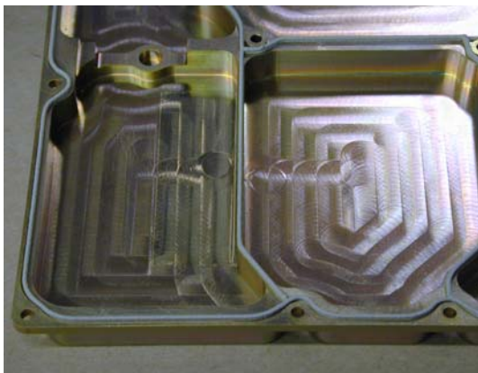
Conductive Gasket on Painted Plastic Housing

The dispensed gasket offer wide size range: Height: 0.015" to 0.090" (0.38 mm to 2.3 mm), Width: 0.018" to 0.125" (0.46 mm to 3.1 mm).