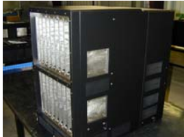
Plated Plastic Router Chassis