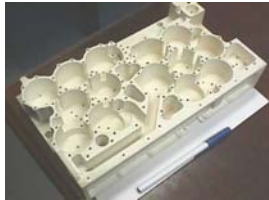
Plated Plastic RF Filter Housing