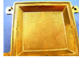
EXACT™ 3D Circuits