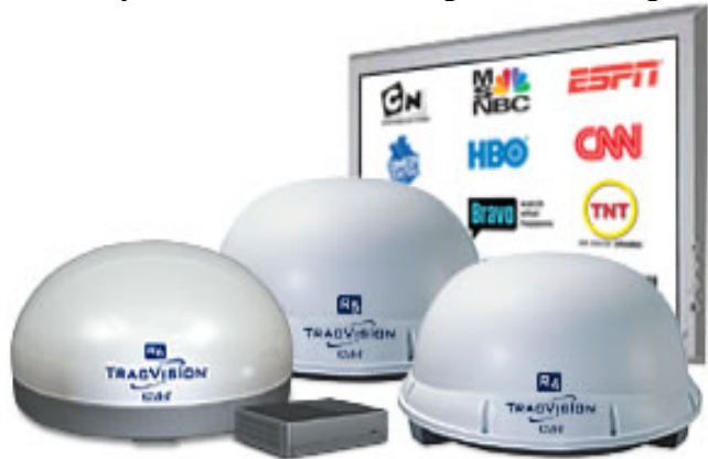
Land Mobile Satellite TV

Cybershield manages the supply chain, ordering the molded waveguides, tapping 4 precision threaded holes and applying the electroless plating. This streamlines the customer ordering process so that they only need to contact Cybershield for all ordering and scheduling of finished plated waveguides.